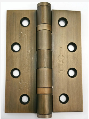
41481.1 - Ball Bearing Grade 13 Fire Rated Hinges - CE / UKCA Marked - Certifire Approved -120kg Weight Limit - 102mm x 76mm - Antique Brass (Lacquered) - Pair

Ball Bearing Grade 13 Fire Rated Hinges - CE / UKCA Marked