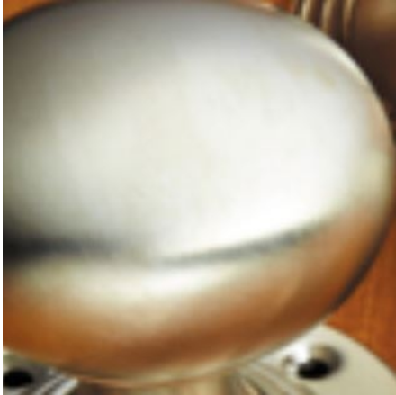
Satin Nickel Plate