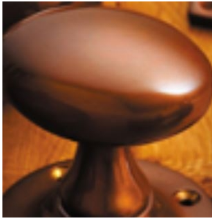
Imitation Bronze Metal Antique