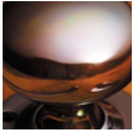
Real Bronze Metal Antique