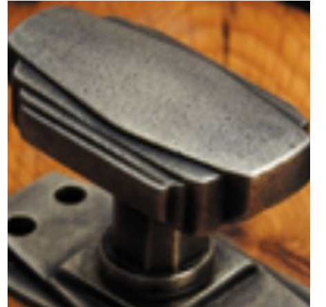
Polished Gunmetal Unlacquered