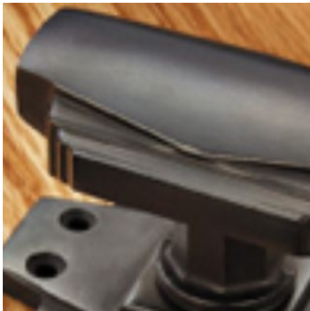
Matte Black Bronze