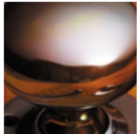
Real Bronze Metal Antique