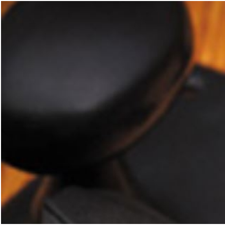
Distressed Oil Rubbed Bronze