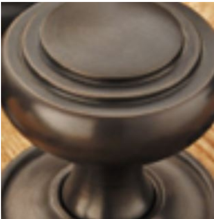
Imitation Bronze Unlacquered