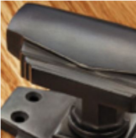
Matte Black Bronze