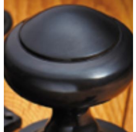
Dark Bronze Metal Antique