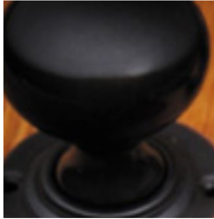
Oil Rubbed Bronze