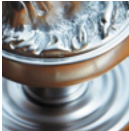
Satin Chrome Plate