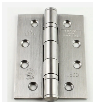
15525.1 - Ball Bearing Grade 13 Fire Rated Hinges - CE / UKCA Marked - Certifire Approved - 120kg Weight Limit - 102mm x 76mm - Satin Stainless Steel - Pair

Ball Bearing Grade 13 Fire Rated Hinges - CE / UKCA Marked