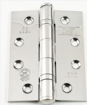
20931.1 - Ball Bearing Grade 13 Fire Rated Hinges - CE / UKCA Marked - Certifire Approved - 120kg Weight Limit - 102mm x 76mm - Polished Stainless Steel - Pair

Ball Bearing Grade 13 Fire Rated Hinges - CE / UKCA Marked