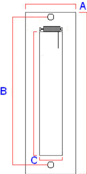
Diagram shows the back of letter plate